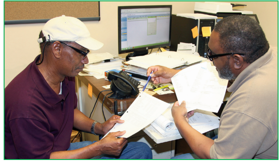
The UAPB Small Farm Program provides assistance to farmers seeking assistance in developing farm business plans or farm financial plans.

The Small Farm Program recommends that individuals interested in applying for FSA loans