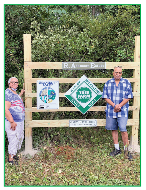
When a property is designated a "Certified Tree Farm," it means it is managed according to a management plan. The tree farm owner has taken the required steps to have the property certified.

Information on the Arkansas program can be found at: https://www.arkforests.org/page/tre efarm.